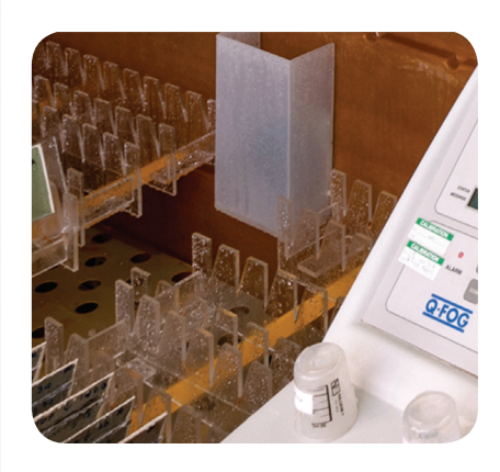
To conduct accelerated corrosion testing in the laboratory, a Q-Fog machine exposes panels to a cyclic environment of salt-laden fog, heat, and humidity.